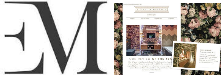
VOGUE The Bathrooms That Deserve A Place On Your Instagram